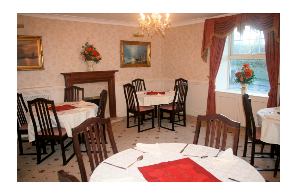
Dining at Amberley