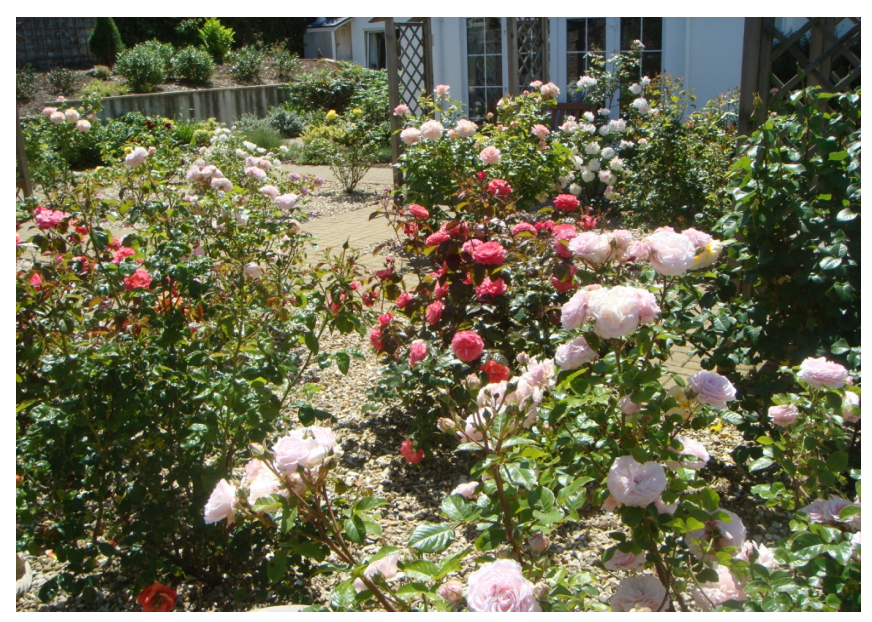
Summer at Amberley